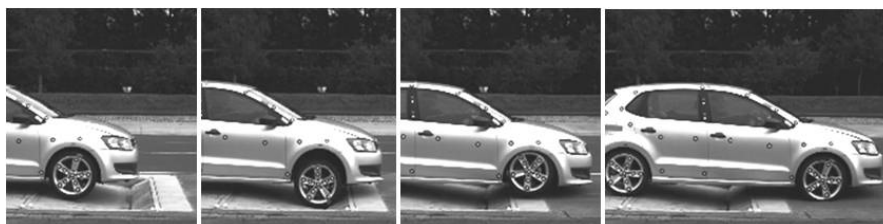
Figure 1: Driving over a pothole or cross–drain [1].

Within a joint project between EDAG and a well–known automotive company the usability and accuracy of a new coupled approach was evaluated. The general idea was to replace bigger parts of the previous FEA model by reduced MBS systems and to couple both simulations in a single application. All critical components with nonlinear deformations can be calculated in Abaqus with the same accuracy as in the full FEA model. However the majority of parts are modeled as rigid bodies or flexible superelements in MSC.Adams with less complexity. These MBS system models are re–used from the standard vehicle dynamics workflows. Both models can be coupled through the standard interface MpCCI.